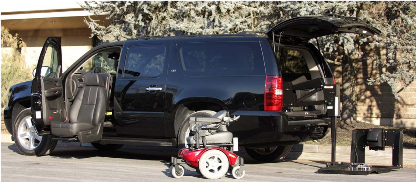
Shown in a 2008 Chevy Suburban

ATRS, Automated Transport and Retrieval System, is a revolutionary transportation mobility solution that integrates robotics and automation technology with existing mobility products. It will enable those with limited mobility who use powered wheelchairs to independently load and unload their wheelchairs from a wide range of standard passenger vehicles that fully conform to NHTSA safety requirements.