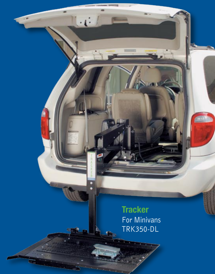
Tracker For Minivans TRK350-DL