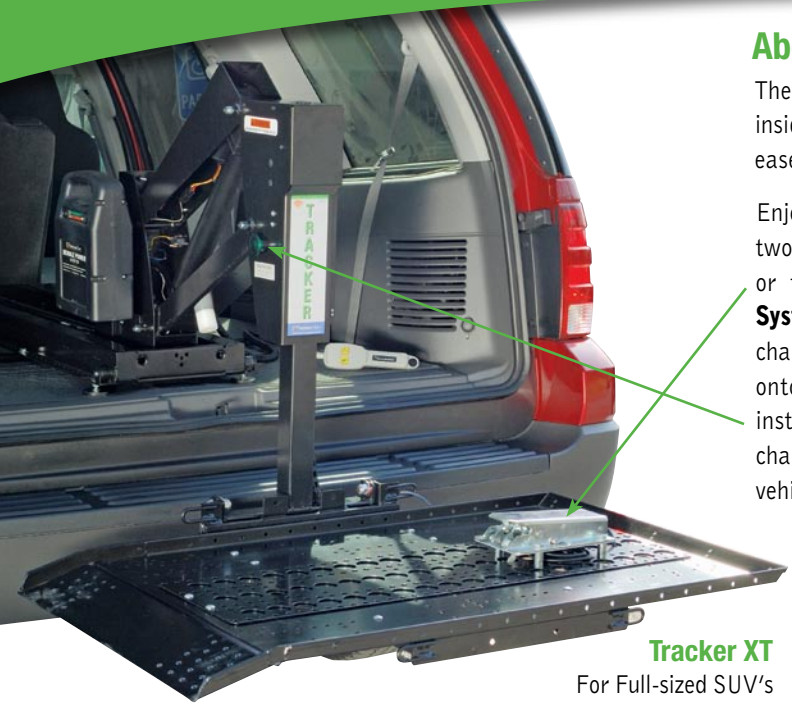
Tracker XT For Full-sized SUV's TRKXT350-DL