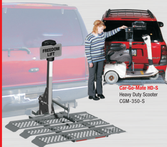
Car-Go-Mate HD-S Heavy Duty Scooter CGM-350-S