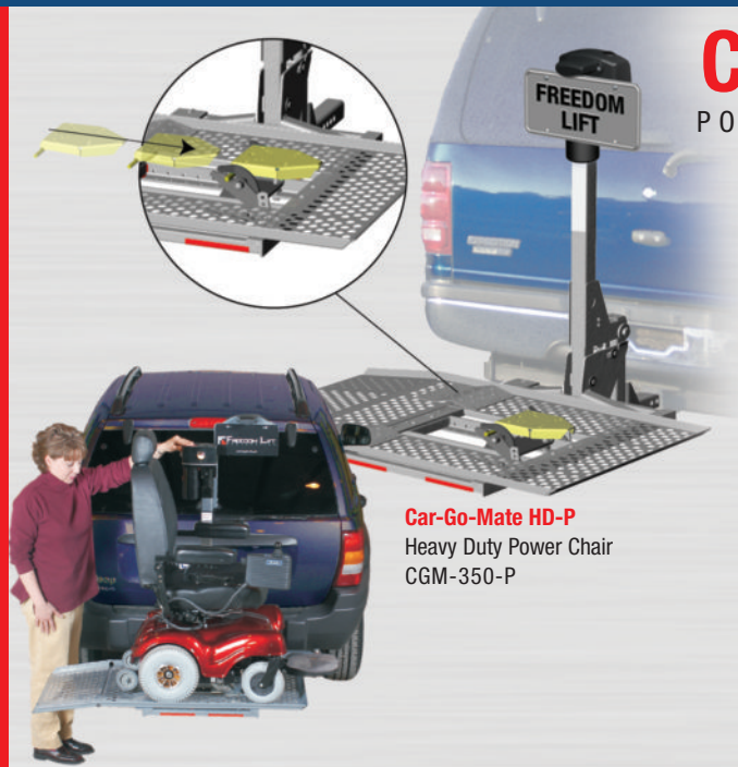
Car-Go-Mate HD-P Heavy Duty Power Chair CGM-350-P