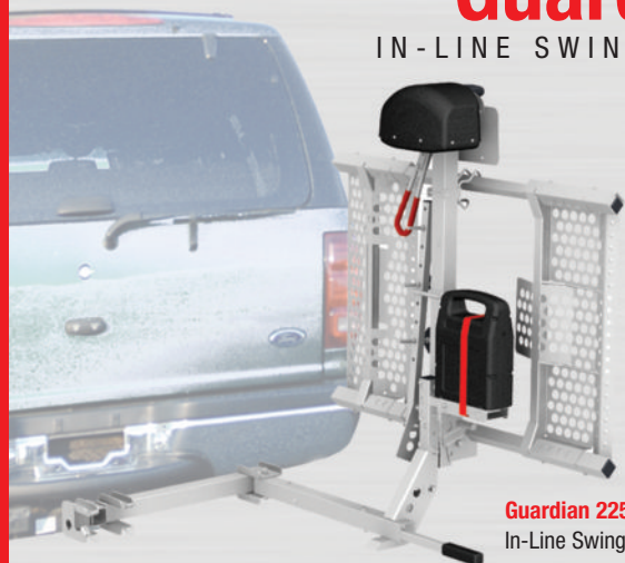
Guardian 225-HD In-Line Swing Away

The Guardian In-Line Swing-Arm is designed to work with any wheelchair, power chair, or scooter lift made to fit a receiver hitch. It attaches easily to the vehicle and allows the unloaded lift to swing away for trunk or tailgate access. The secure latching device provides easy movement with minimal effort. The Guardian comes pre-wired to facilitate lift electrical connections and is available on all Car-Go-Mate Class I, II and Class III (2") lifts.